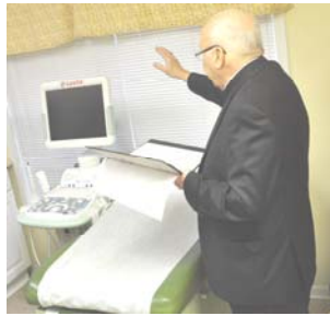
Official Blessing of Ultrasound Machine, 3/2/2012