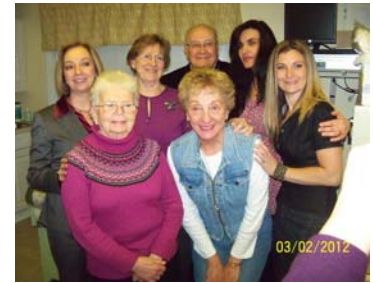
Life Choices volunteers are all smiles with Bishop Bootkoski